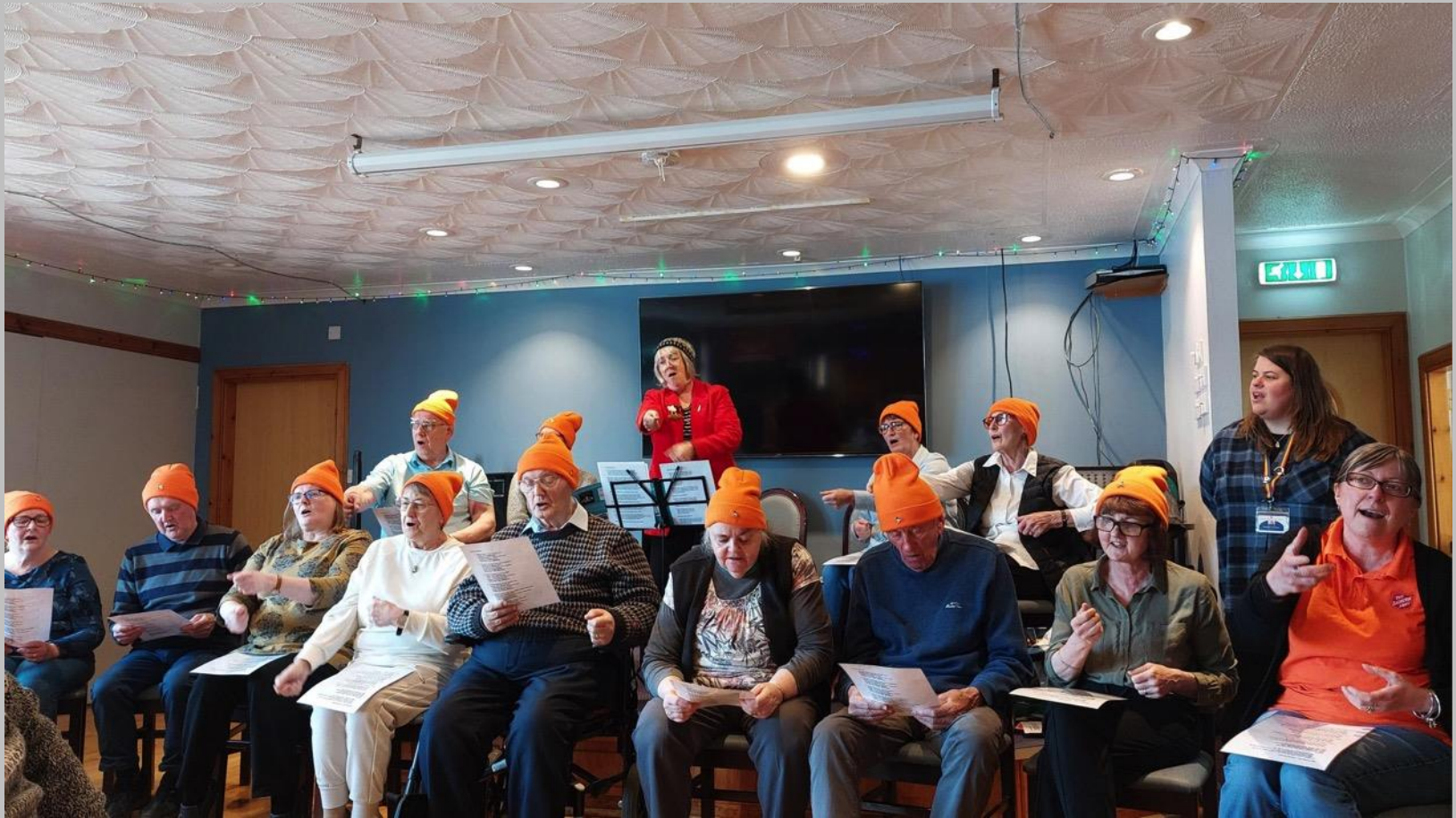
Shalder Shanty Crew singing for the Over 70's lunch in Scalloway Shetland